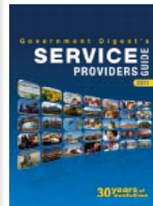
A4 GD Service Providers Guide - Annual