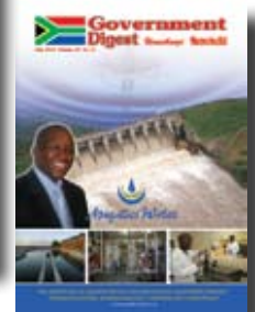
A4 Monthly Magazine

Government Digest offers your organisation the ideal medium to communicate and market your services to decision-makers in government and to government stakeholders alike.