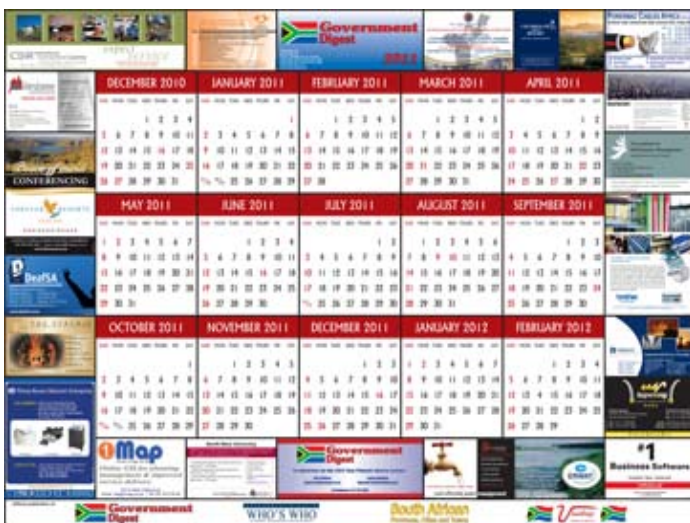
A1 Wall Planner

Other regular sections include News Focus, SADC focus and Umsebenzi which covers skills development.