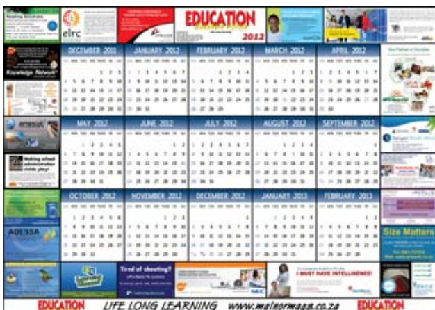
A1 Wall Calendar – R6 000 per block ad

Furthermore, we reach another 12 000 schools through our Newsletter and online publication. For our advertisers, we place all the ads that appear in the magazine on the newsletter to increase their visibility. This gives an effective audience of 31 – 41 000 readers.